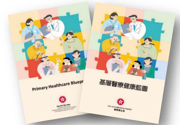
Primary Healthcare Blueprint